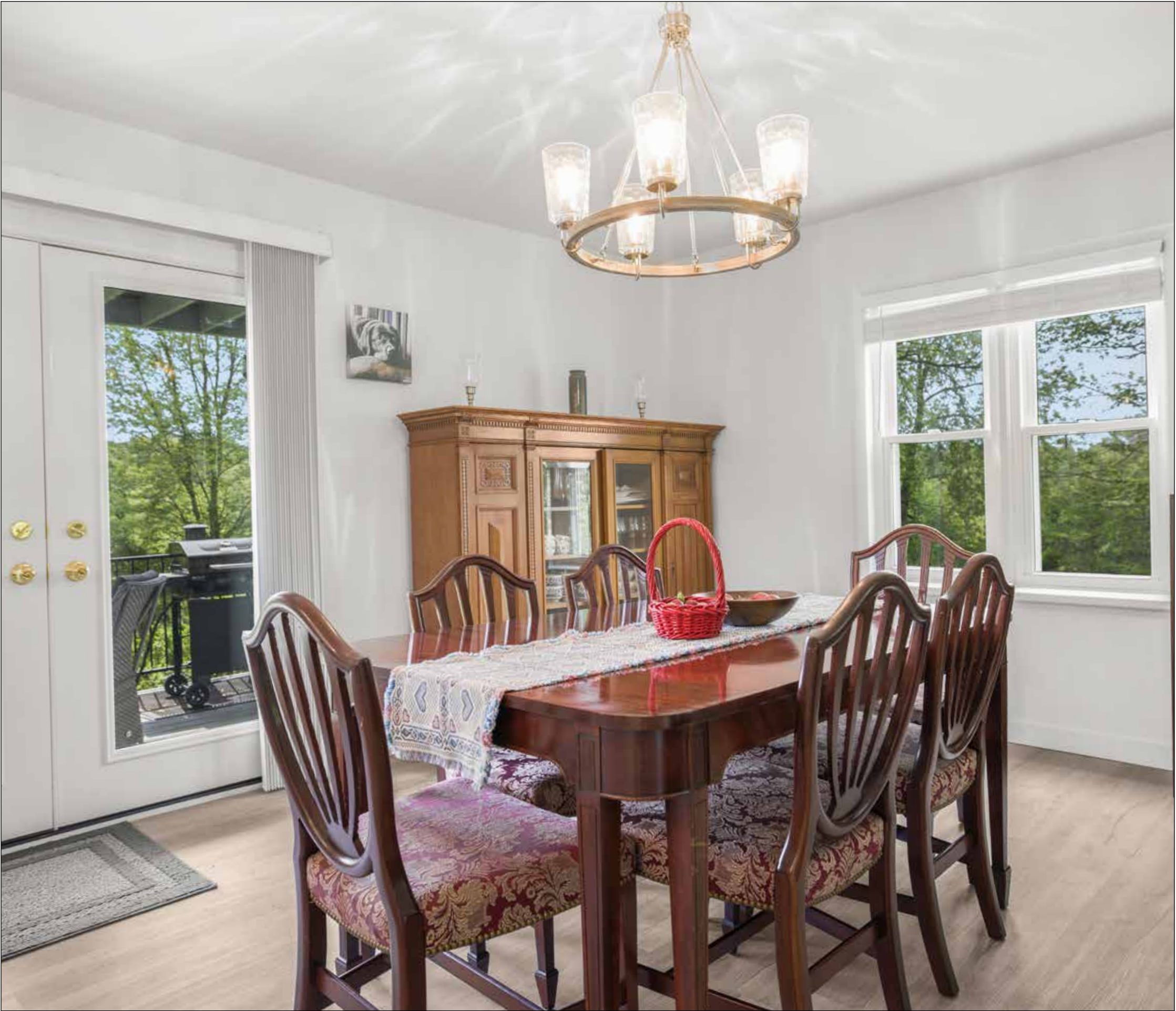
A Welcoming Space for Meals