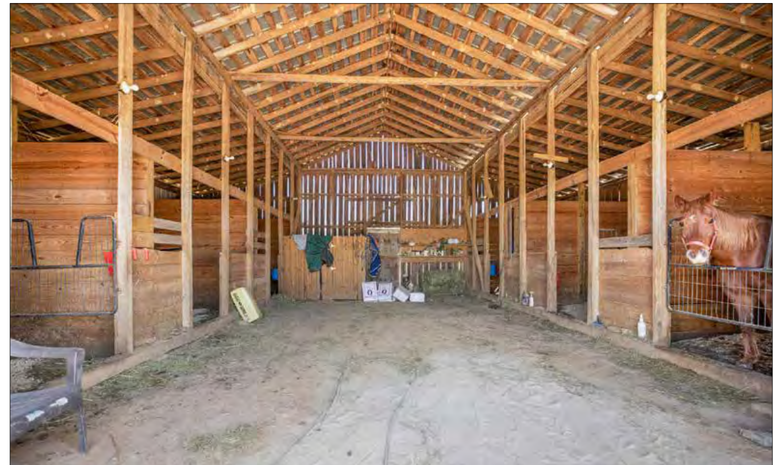
8 Stall Barn