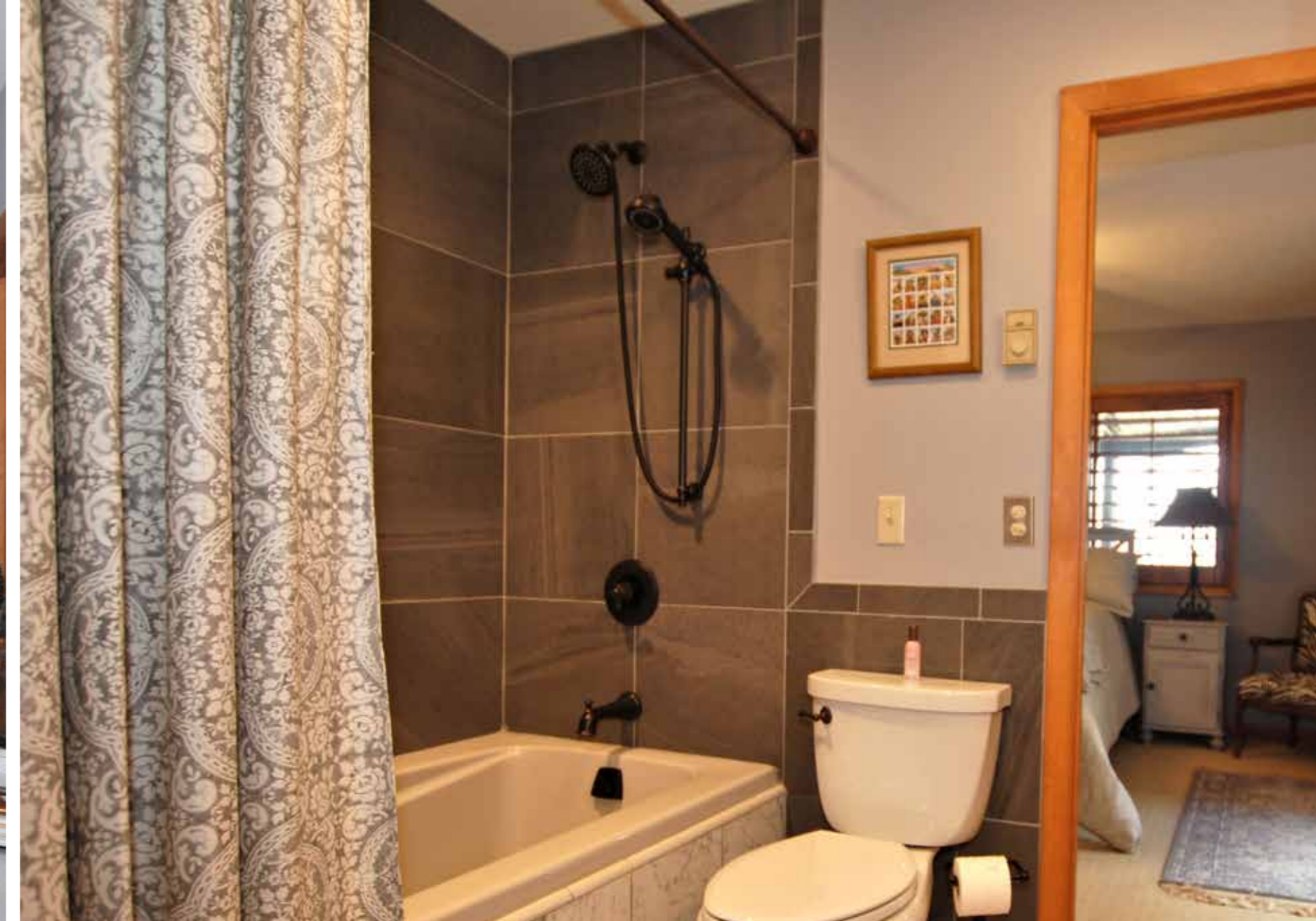
First Level Bedroom With Attached Shared Bath