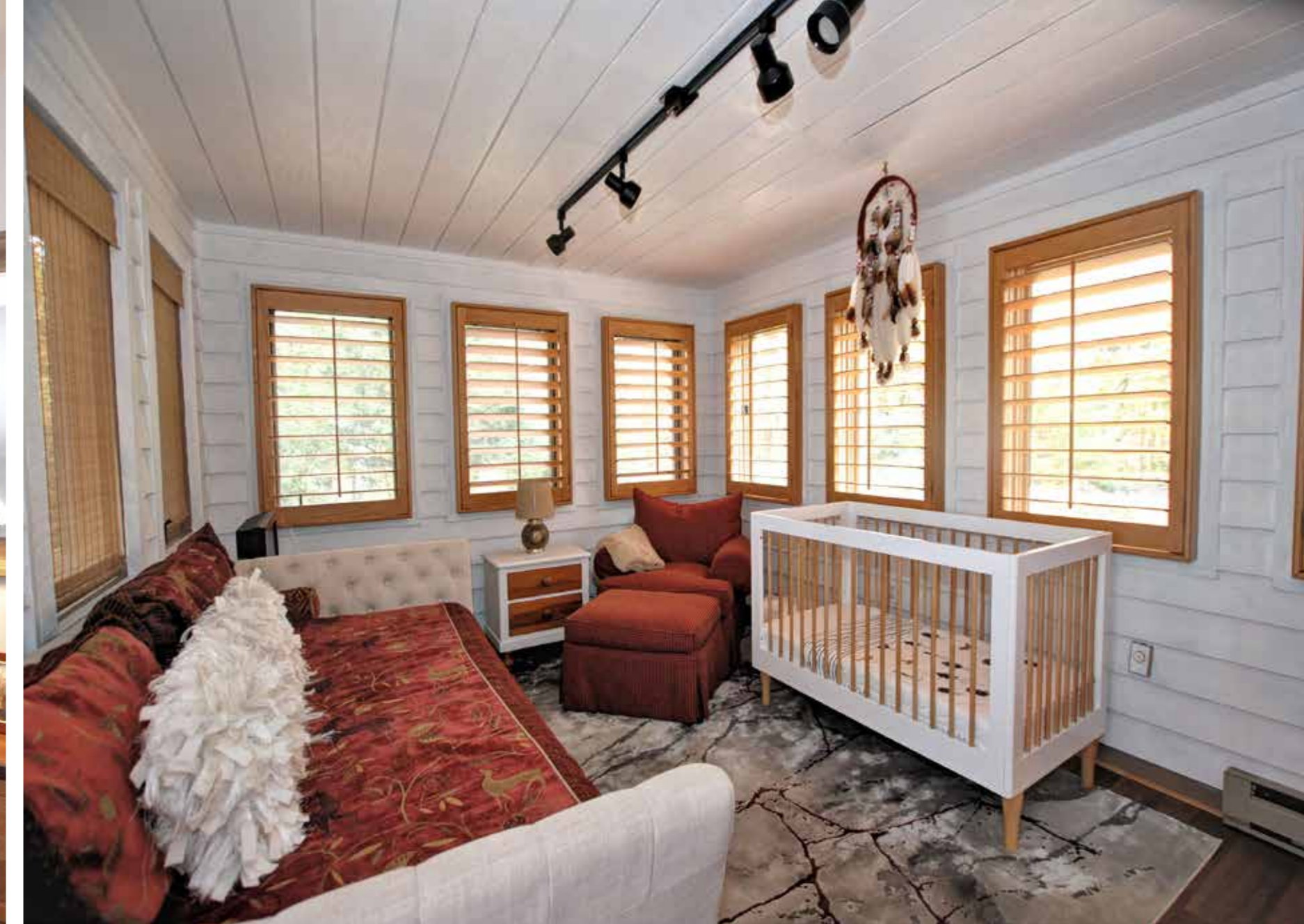
First Level Bedroom With Attached Nursery