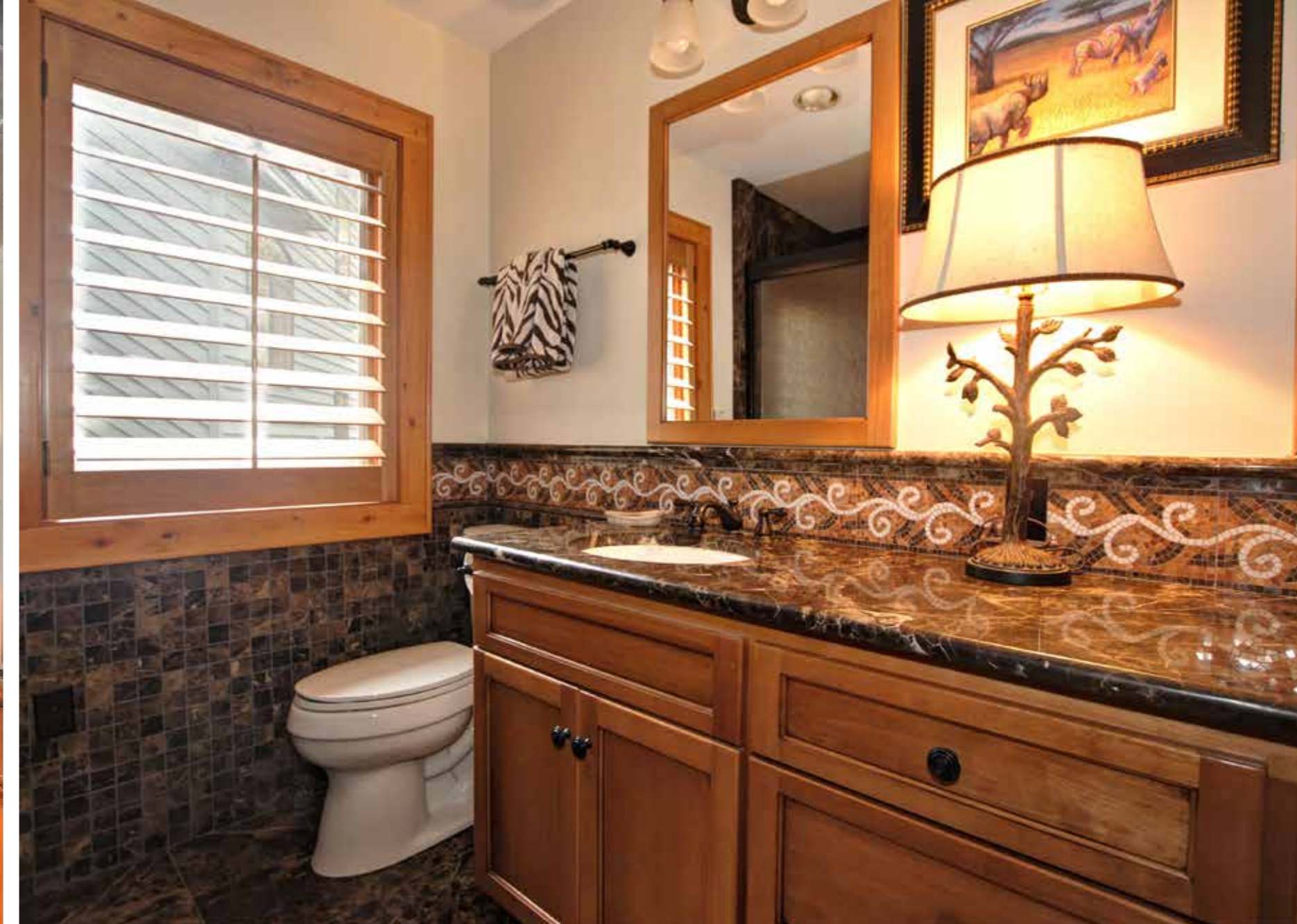
First Level Primary Suite