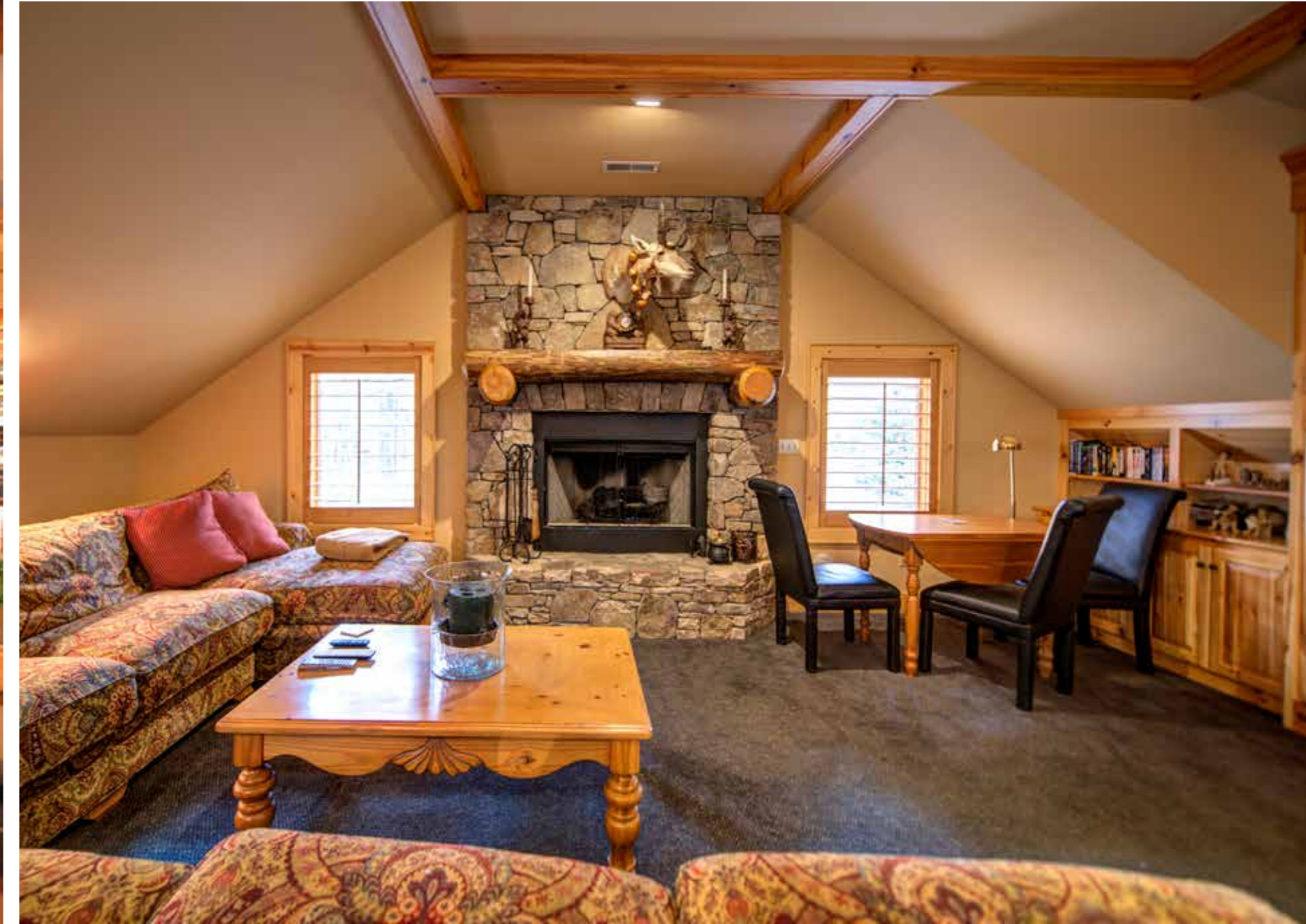
The Recreation Room