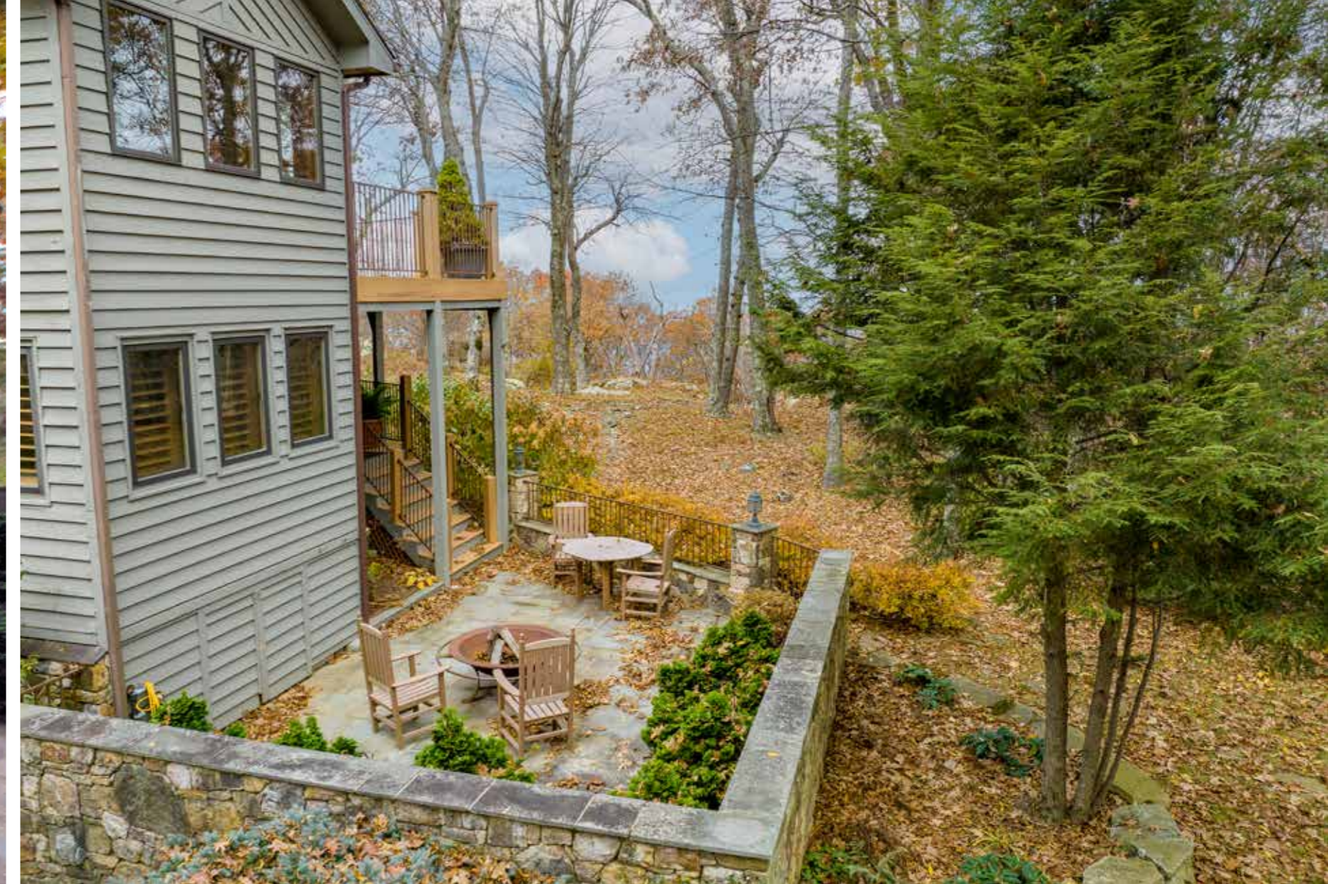
Fire Pit Seating Area Off The Den