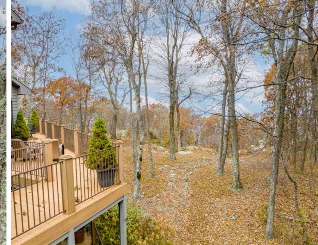
At The Edge Of The George Washington National Forest