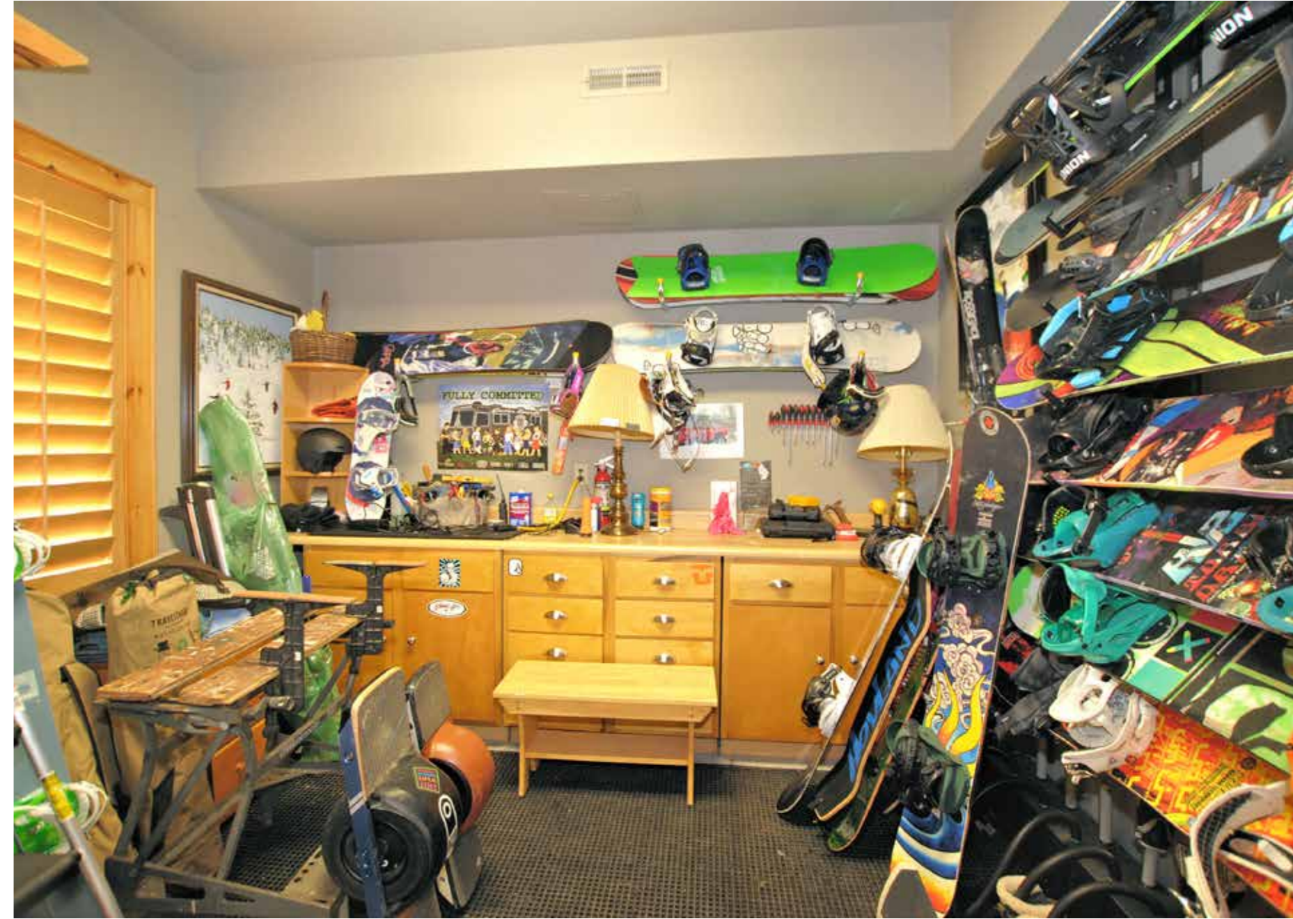
Garage & Ski Locker Room