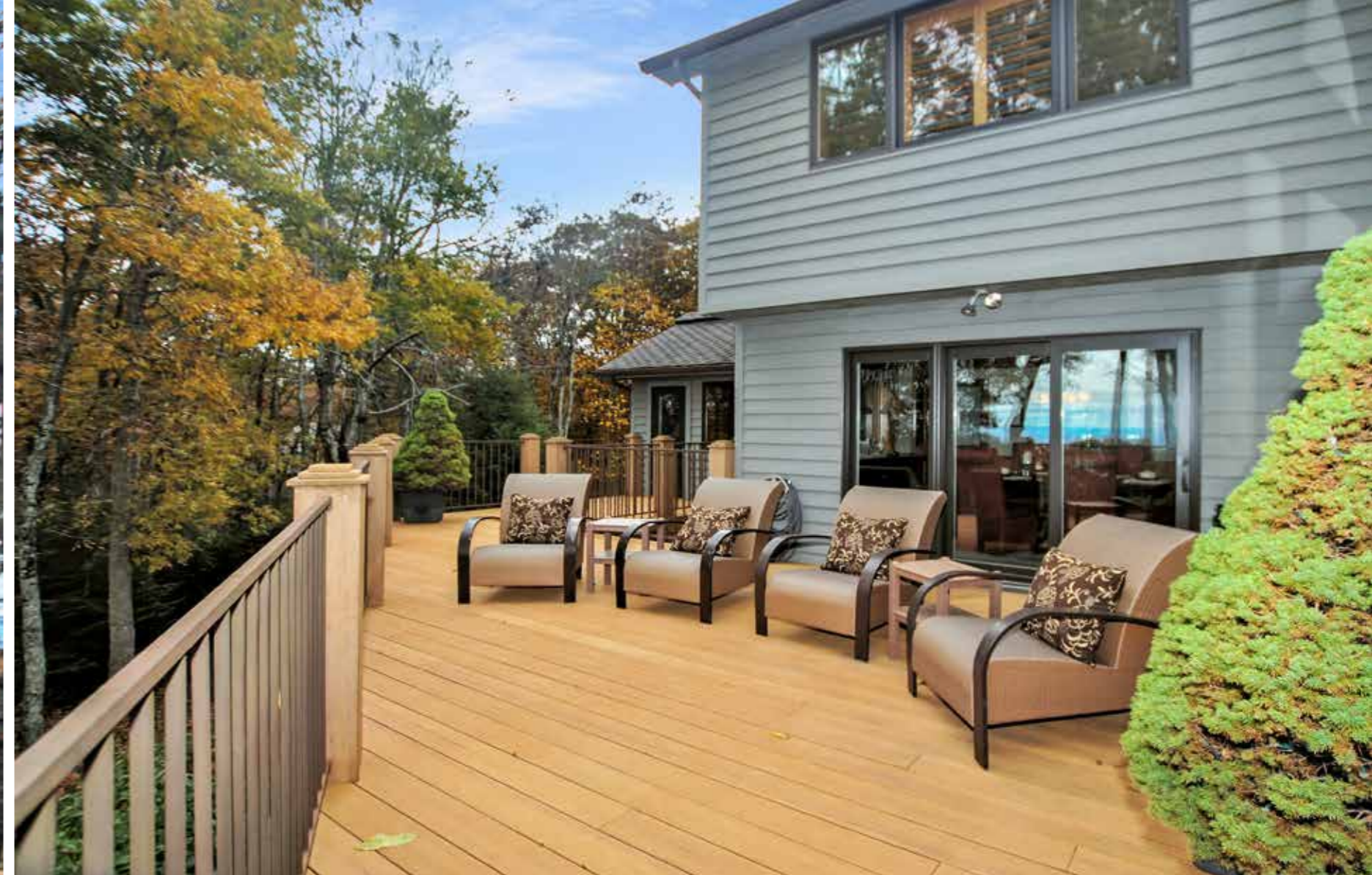
Seating Areas Off Family Room & Dining Room The Sounds & Sights Of Nature