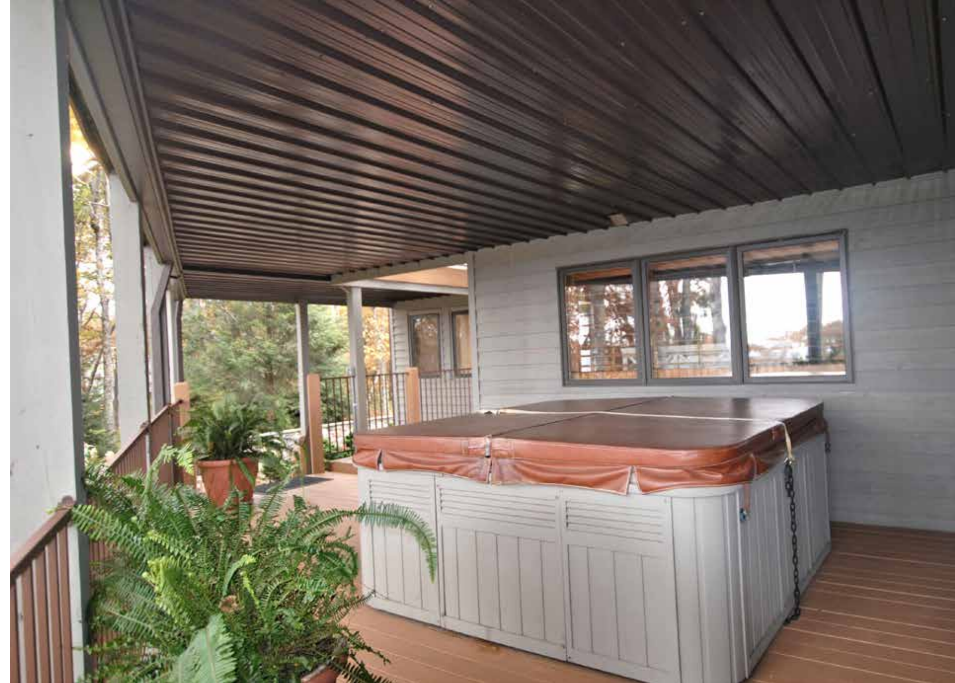
The Hot Tub located off the Primary Suite