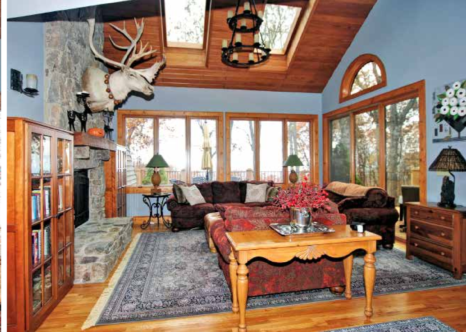
The Family Room